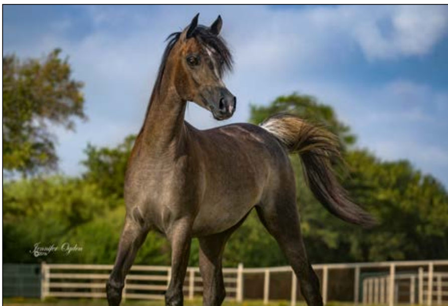
Malak Al Jood