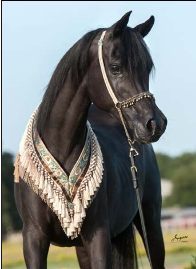
Rhapsody in Black