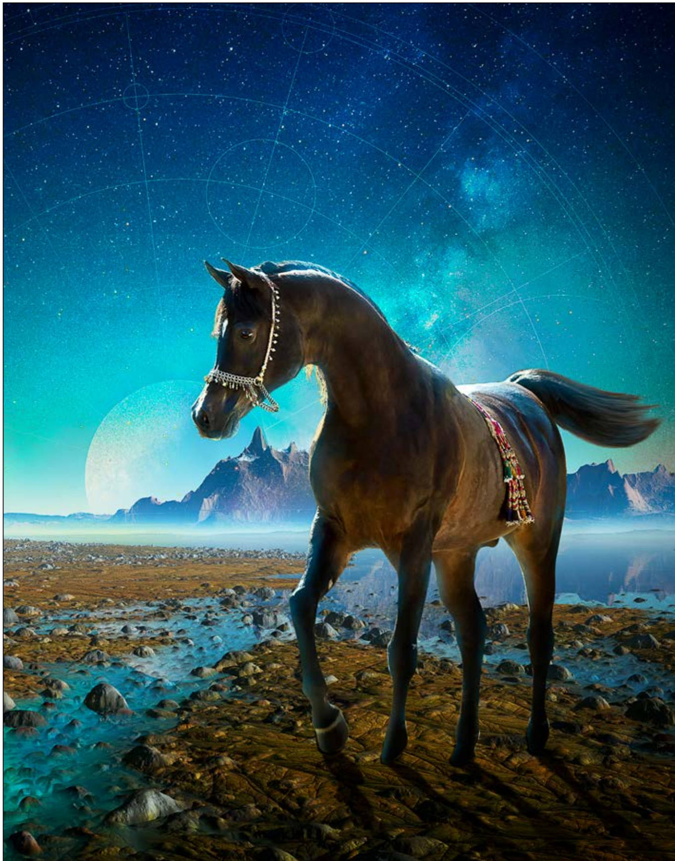
Alixir (The Elixir x The Prevue)